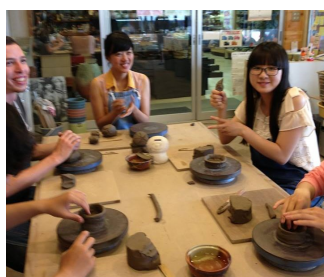
← Pottery Making (Shigaraki)

* exchange rates as of 10/17/2014 (may change slightly)