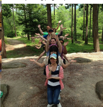
↑ Visit to the Ancient Capital (Shigaraki)