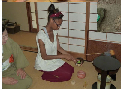
← Tea Ceremony Class

Contact your Study Abroad office or Japanese Language Department on how to apply!