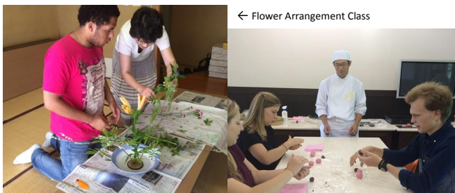
← Flower Arrangement Class

* Start dates for the 4 week program may be subject to change based on occupancy