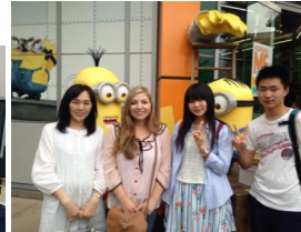
↑ Weekend Homestay ↓ Nara